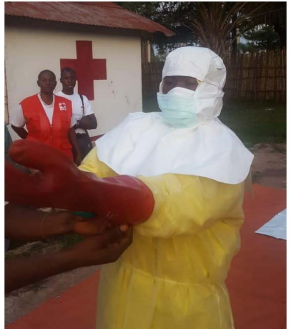
Mbandaka, Equateur Province (DRC). A team of IFRC and DRC Red Cross deployed to respond to the Ebola outbreak with life-saving supplies and Ebola Personal Protective Equipment (PPE)

21 May 2018: The IFRC launches an Emergency Appeal for 1,630,297 Swiss francs to serve 716,850 people for 6 months.